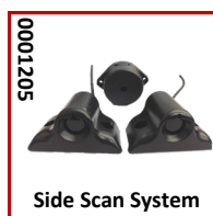
Side Scan System