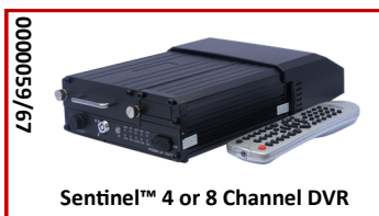
Sentinel™ 4 or 8 Channel DVR